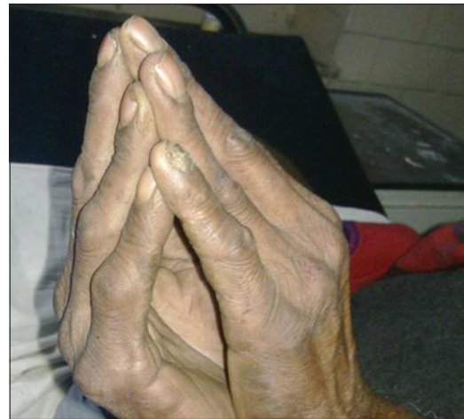
Figure 2: The preacher's sign involves the patient holding the hands opposed to one another vertically with elbows flexed and wrists extended. A positive sign is indicated by an inability of the patient to completely approximate the palmar surface of the digits

Since only few studies have been reported from India that compared rheumatic manifestations in a cohort of diabetic patients with control group, one such effort was made by Sarkar, et al. [4] The characteristics of diabetic foot disease are well documented in India; henceforth it would be appropriate to evaluate the problem of diabetic hand syndrome in this environment, and an attempt to characterize the relevance