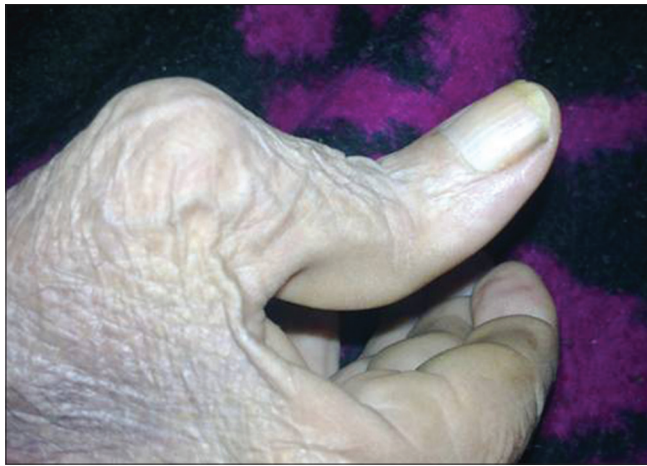
Figure 1: Diabetic cheiroarthropathy or stiff hand syndrome

neglected until hand deformity is severe enough to interfere with daily life.